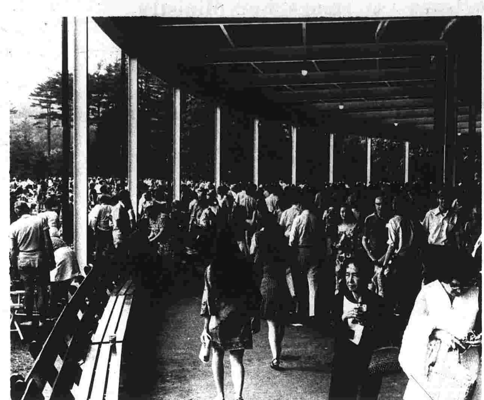
TANGLEWOOD

Mr. Waldheim is never bombed in their homes. Most other people in the world know what it is like to have sudden destruction descend from the skies.