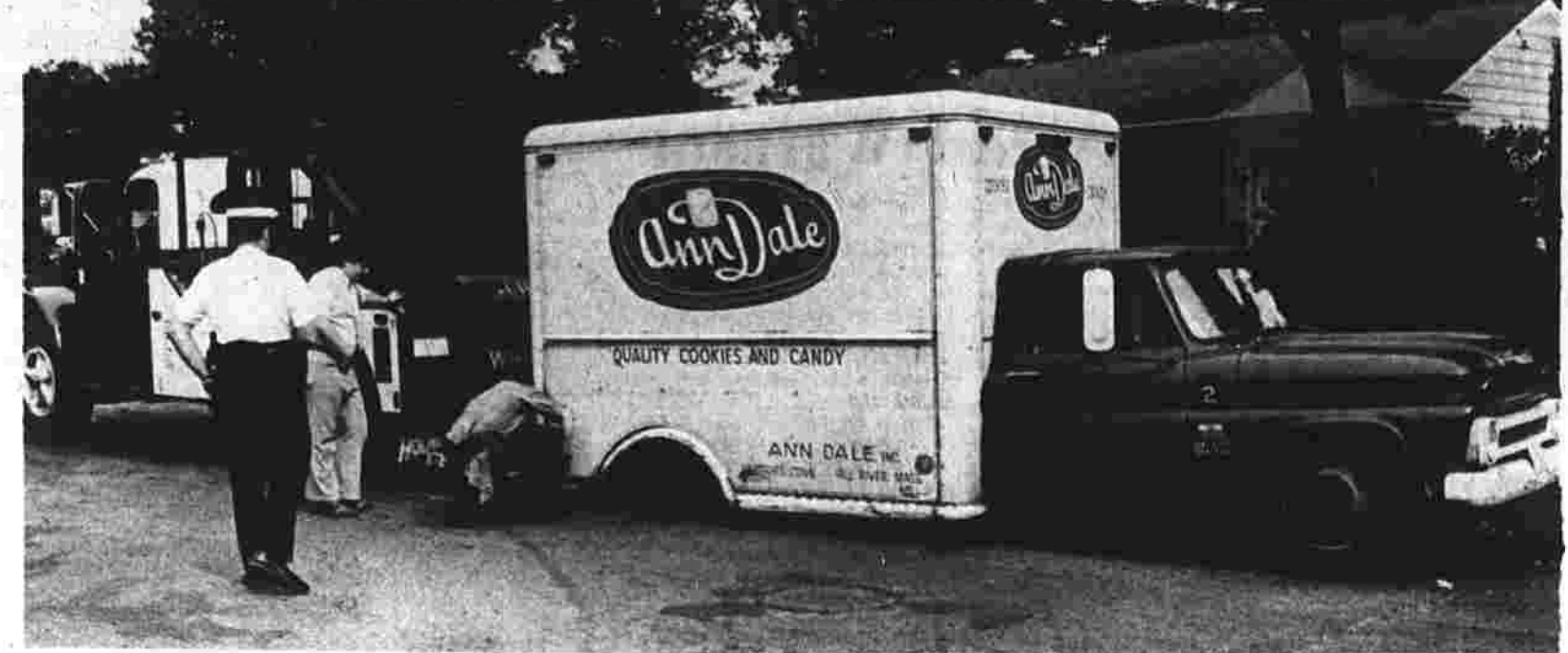
Truck Loses Its Wheels on W. Middle Tpk.